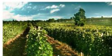
Republic of MACEDONIA